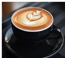
a cup of

Look at the pictures and read the words / expressions.