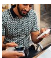
get the bill