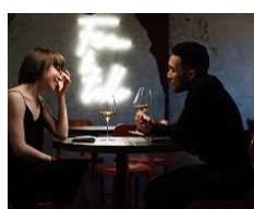
a table for two