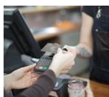
pay by card